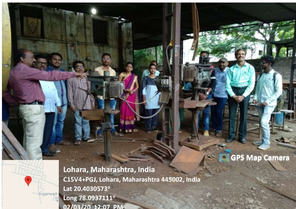
Participants Visit to Tirupati Industries, Date: 02/03/2020